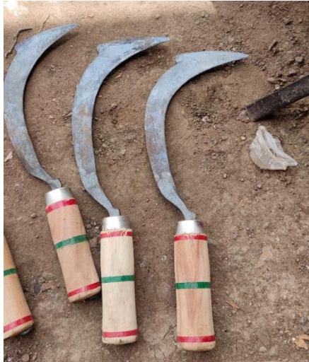
Hand Tools Khurpi and Hand Harrow