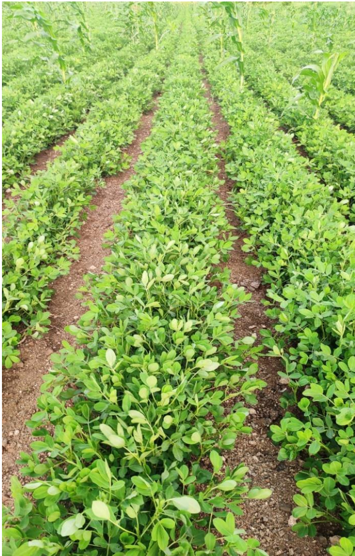
Weed-free Groundnut and Cotton